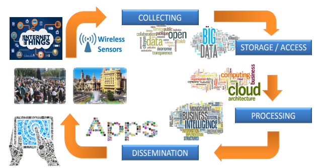
Fig. 1. Information Flow Diagram using TICs in a Smart City.

The use of ICT in a smart city involves four main phases related to the flow of information. Figure 1 shows a diagram in which the flow of information is represented. The phases are discussed below: